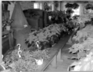
Poinsettia & Greens Festival