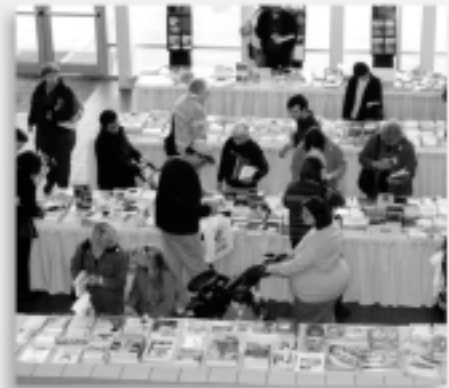
Random House Book Fair