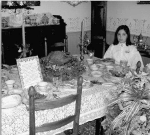
Farm Museum Holiday Tour