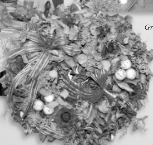
Festival of Wreaths