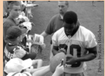
Ravens' safety Ed Reed signs autographs for fans.

The NFL's Baltimore Ravens held their 9th summer training camp at McDaniel College this summer. New owner Steve Bisciotti, has signed a contract to keep the summer camp here through 2010. The camp attracts thousands of visitors to our area and the Tourism Office again hosted a booth with information about the hotels, B&Bs, restaurants, golf courses and shopping sites in the county. Come see the players “up close and personal” next year and let's hope our Ravens have a great season! ◀