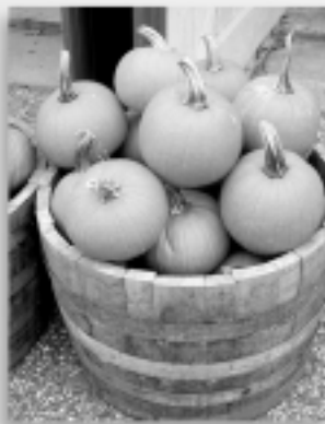
Fall Harvest Days