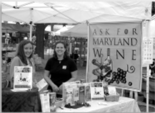
The Maryland Wine Festival