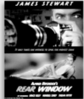
Alfred Hitchcock Film Festival