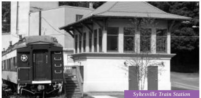
Sykesville Train Station