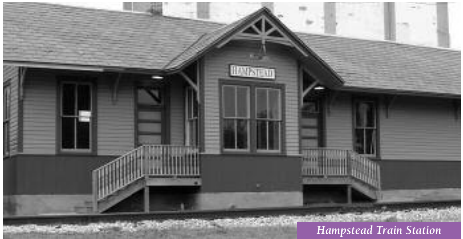
Hampstead Train Station

In 2005, the Western Maryland Railway Museum welcomed more than 700 visitors. The Western Maryland Railway Historical Society was founded in 1967 to preserve the heritage and history of the Western Maryland Railway (WMRY) and its predecessors. The society's museum complex at 41 North Main Street in Union Bridge is at home in a former WMRY office building and passenger station. The museum houses an extensive collection of railroad artifacts, archival materials, a large photo collection and an extensive railroader's library featuring historical and technical publications relating to WMRY and other railroads. Major exhibits include caller's boards from Hagerstown and Ridgeley, and the Centralized Traffic Control panel for part of the Lurgan Subdivision. There is an HO-scale model layout to enjoy, and an N-scale layout is under construction. The museum is open Sundays, 1 to 4 p.m.,